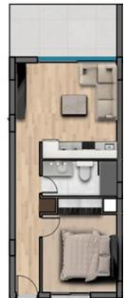
1 BEDROOM APARTMENT