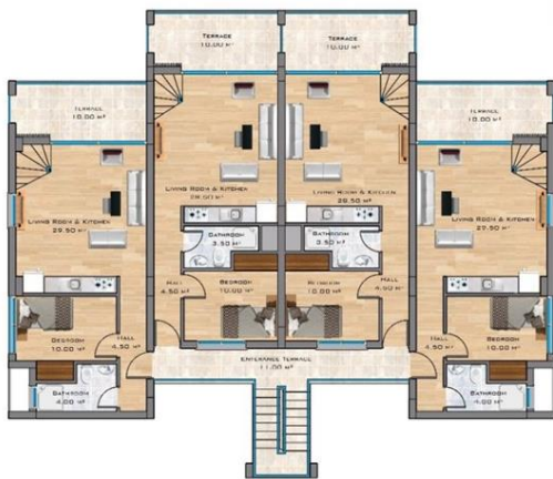
2 BEDROOM LOFT GROUND FLOOR