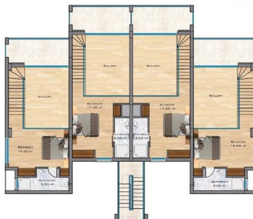
2 BEDROOM LOFT MEZZANINE FLOOR